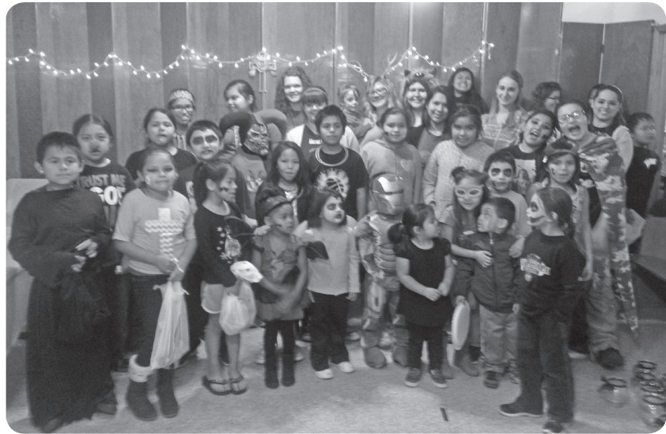
Kappa Phi ladies with Clinton kids at 2015 Fall Fest

Today in 2016, the relationship between both ministries is still going strong. The Clinton mission project is very grateful and blessed to be associated with such a wonderful group of Christian women seeking to bring change to the world. Each year the national organization of Kappa Phi chooses a nonprofit and Christian organization to support with their tithe. The CICCC had been nominated by the SWOSU Kappa Phi chapter and they were chosen to be the recipient of this award. CICCC is honored to accept this generous monetary gift from Kappa Phi Club that will assist in providing the needs of the Cheyenne and Arapaho children and youth of the CICCC.