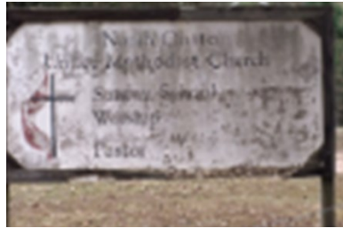
Historical: Nanih Chito